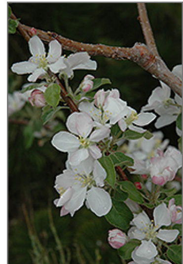
Pink Lady Apple flowers