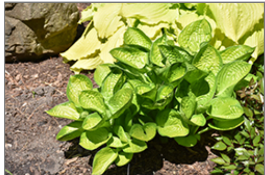
Rainforest Sunrise Hosta