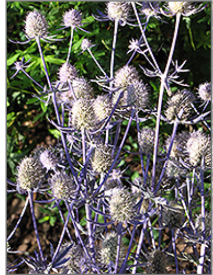
Jade Frost Variegated Sea Holly flowers

Jade Frost Variegated Sea Holly will grow to be about 8 inches tall at maturity extending to 24 inches tall with the flowers, with a spread of 15 inches. When grown in masses or used as a bedding plant, individual plants should be spaced approximately 12 inches apart. Its foliage tends to remain low and dense right to the ground. It grows at a medium rate, and under ideal conditions can be expected to live for approximately 10 years. As an herbaceous perennial, this plant will usually die back to the crown each winter, and will regrow from the base each spring. Be careful not to disturb the crown in late winter when it may not be readily seen!