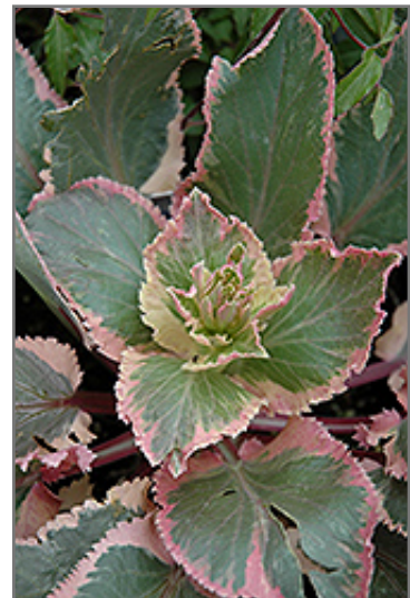
Jade Frost Variegated Sea Holly foliage