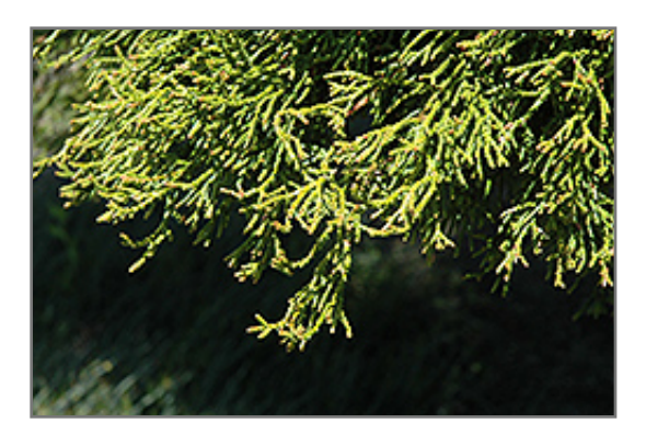
Coralliformis Dwarf Hinoki Falsecypress foliage

Coralliformis Dwarf Hinoki Falsecypress is recommended for the following landscape applications;