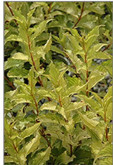
Ghost Weigela foliage