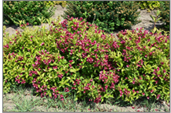
Ghost Weigela in bloom

This shrub should only be grown in full sunlight. It prefers to grow in average to moist conditions, and shouldn't be allowed to dry out. It is not particular as to soil type or pH. It is highly tolerant of urban pollution and will even thrive in inner city environments. This is a selected variety of a species not originally from North America.