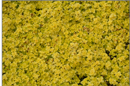
Golden Stonecrop foliage

Golden Stonecrop is recommended for the following landscape applications;