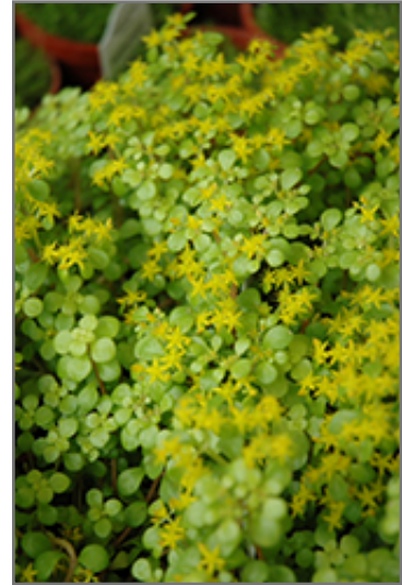
Golden Stonecrop flowers

This plant does best in full sun to partial shade. It prefers dry to average moisture levels with very well-drained soil, and will often die in standing water. It is considered to be drought-tolerant, and thus makes an ideal choice for a low-water garden or xeriscape application. It is not particular as to soil pH, but grows best in poor soils, and is able to handle environmental salt. It is highly tolerant of urban pollution and will even thrive in inner city environments. This is a selected variety of a species not originally from North America. It can be propagated by division; however, as a cultivated variety, be aware that it may be subject to certain restrictions or prohibitions on propagation.