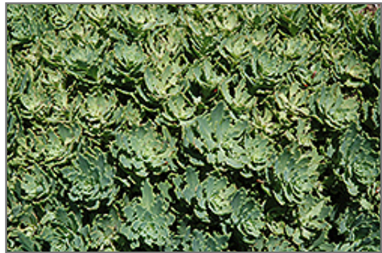
Thundercloud Stonecrop