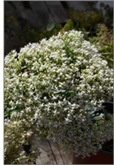
Thundercloud Stonecrop flowers

Thundercloud Stonecrop will grow to be about 8 inches tall at maturity, with a spread of 10 inches. When grown in masses or used as a bedding plant, individual plants should be spaced approximately 8 inches apart. It grows at a fast rate, and under ideal conditions can be expected to live for approximately 15 years. As an herbaceous perennial, this plant will usually die back to the crown each winter, and will regrow from the base each spring. Be careful not to disturb the crown in late winter when it may not be readily seen!