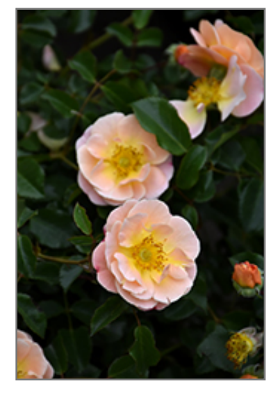
Flower Carpet Amber Rose flowers