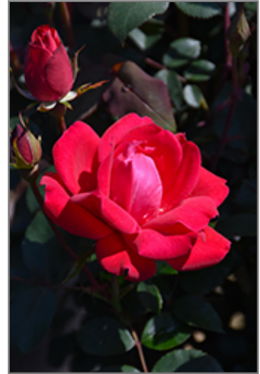
Double Knock Out Rose flowers