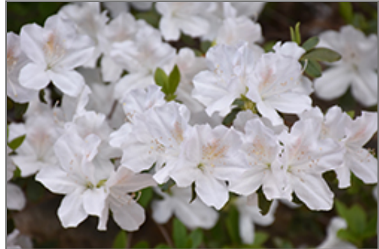
Delaware Valley White Azalea flowers