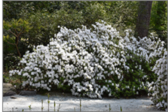
Delaware Valley White Azalea in bloom