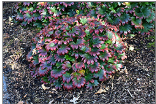
Crimson Fans Mukdenia