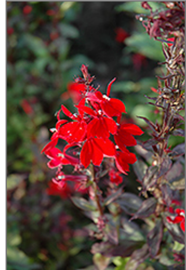
Queen Victoria Lobelia flowers