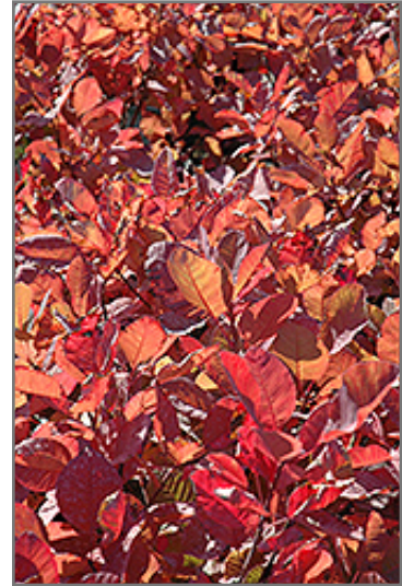
Grace Smokebush in fall

This shrub should only be grown in full sunlight. It is very adaptable to both dry and moist locations, and should do just fine under average home landscape conditions. It is not particular as to soil type or pH. It is highly tolerant of urban pollution and will even thrive in inner city environments. This is a selected variety of a species not originally from North America.