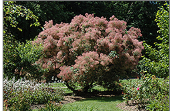
Grace Smokebush in bloom