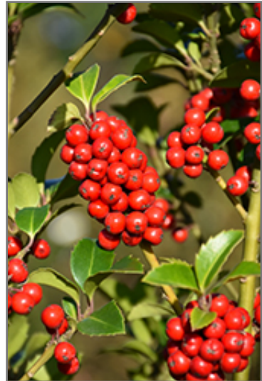
Castle Spire Meserve Holly fruit