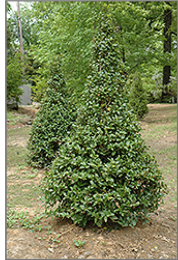
Castle Spire Meserve Holly