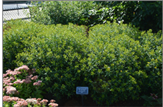
Sunny Boulevard St. John's Wort

Sunny Boulevard St. John's Wort makes a fine choice for the outdoor landscape, but it is also well-suited for use in outdoor pots and containers. With its upright habit of growth, it is best suited for use as a 'thriller' in the 'spiller-thriller-filler' container combination; plant it near the center of the pot, surrounded by smaller plants and those that spill over the edges. It is even sizeable enough that it can be grown alone in a suitable container. Note that when grown in a container, it may not perform exactly as indicated on the tag - this is to be expected. Also note that when growing plants in outdoor containers and baskets, they may require more frequent waterings than they would in the yard or garden.