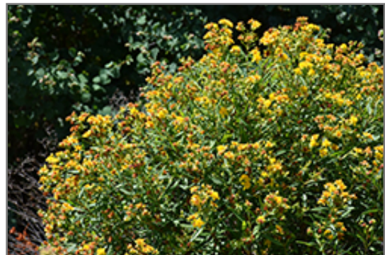
Sunny Boulevard St. John's Wort in bloom