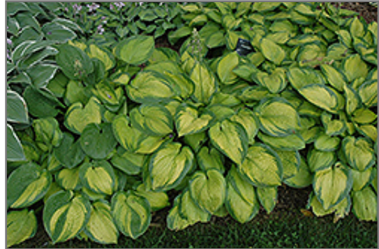
Paradigm Hosta

Paradigm Hosta will grow to be about 10 inches tall at maturity extending to 18 inches tall with the flowers, with a spread of 4 feet. When grown in masses or used as a bedding plant, individual plants should be spaced approximately 4 feet apart. Its foliage tends to remain low and dense right to the ground. It grows at a medium rate, and under ideal conditions can be expected to live for approximately 10 years. As an herbaceous perennial, this plant will usually die back to the crown each winter, and will regrow from the base each spring. Be careful not to disturb the crown in late winter when it may not be readily seen!