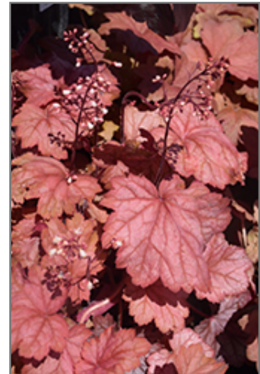
Georgia Peach Coral Bells in bloom