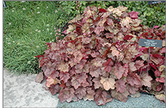
Georgia Peach Coral Bells

Georgia Peach Coral Bells is recommended for the following landscape applications;