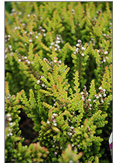
Firefly Heather foliage