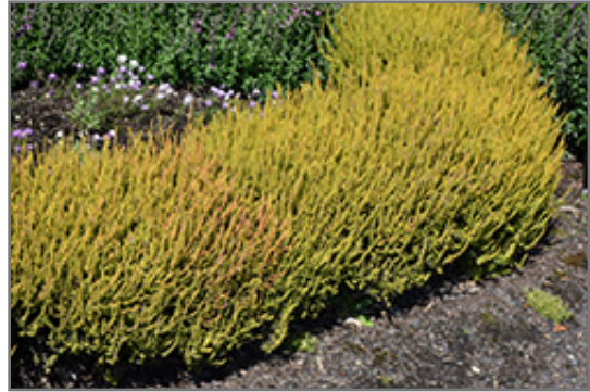
Firefly Heather

This shrub should only be grown in full sunlight. It requires an evenly moist well-drained soil for optimal growth, but will die in standing water. It is very fussy about its soil conditions and must have sandy, acidic soils to ensure success, and is subject to chlorosis (yellowing) of the foliage in alkaline soils. It is somewhat tolerant of urban pollution, and will benefit from being planted in a relatively sheltered location. Consider applying a thick mulch around the root zone in winter to protect it in exposed locations or colder microclimates. This is a selected variety of a species not originally from North America.