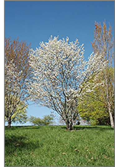
Princess Diana Serviceberry in bloom

Princess Diana Serviceberry will grow to be about 20 feet tall at maturity, with a spread of 15 feet. It has a low canopy with a typical clearance of 4 feet from the ground, and is suitable for planting under power lines. It grows at a medium rate, and under ideal conditions can be expected to live for 40 years or more.