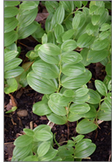
Solomon's Seal foliage