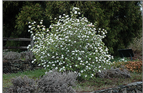
Koreanspice Viburnum in bloom

Koreanspice Viburnum is recommended for the following landscape applications;