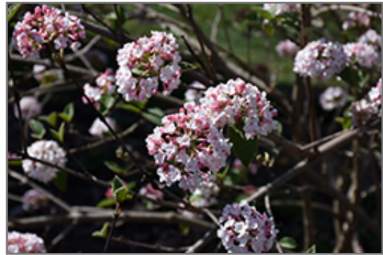
Koreanspice Viburnum flowers