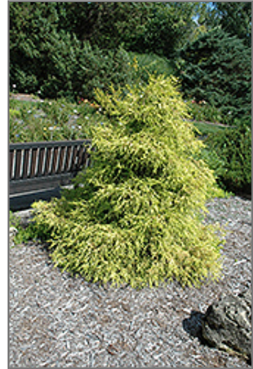
Lemon Thread Falsecypress