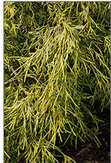
Lemon Thread Falsecypress foliage