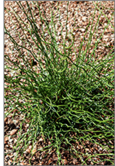
Curly Wurly Corkscrew Rush