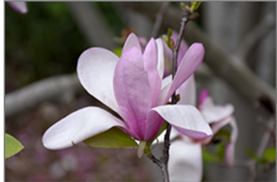
Jane Magnolia flowers

This shrub does best in full sun to partial shade. It requires an evenly moist well-drained soil for optimal growth, but will die in standing water. It is not particular as to soil type, but has a definite preference for acidic soils. It is quite intolerant of urban pollution, therefore inner city or urban streetside plantings are best avoided. Consider applying a thick mulch around the root zone in winter to protect it in exposed locations or colder microclimates. This particular variety is an interspecific hybrid.