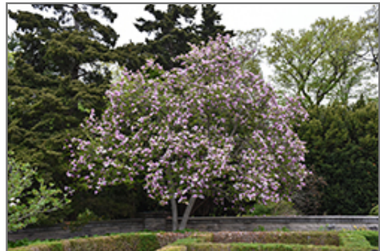
Jane Magnolia in bloom