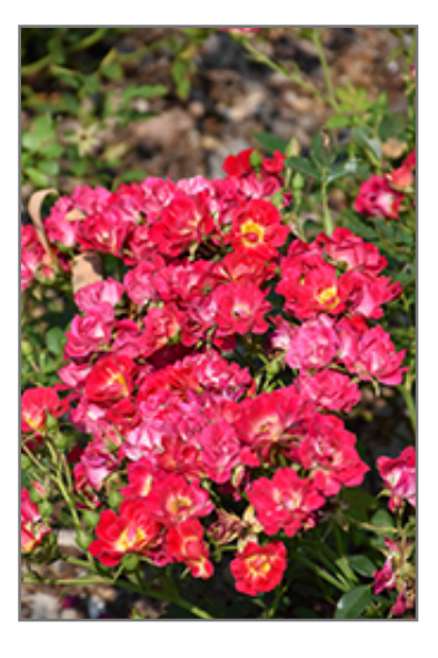
Pink Drift Rose flowers

Pink Drift Rose is recommended for the following landscape applications;