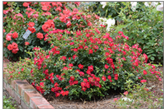
Red Drift Rose in bloom