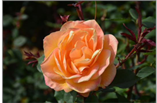
Strike It Rich Rose flowers