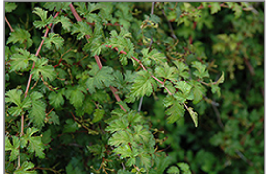
Cutleaf Stephanandra foliage