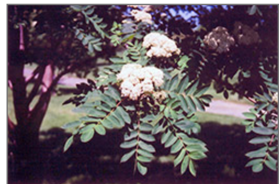
Showy Mountain Ash flowers