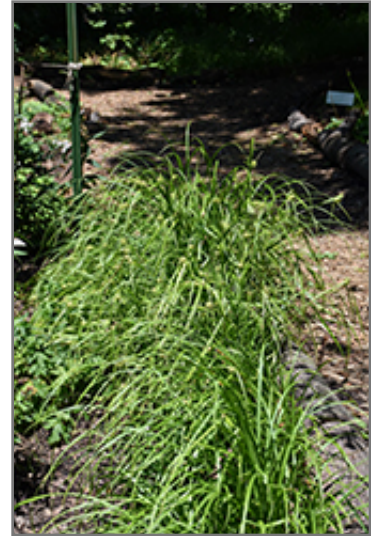
Gray's Sedge

Gray's Sedge is a fine choice for the garden, but it is also a good selection for planting in outdoor pots and containers. With its upright habit of growth, it is best suited for use as a 'thriller' in the 'spiller-thriller-filler' container combination; plant it near the center of the pot, surrounded by smaller plants and those that spill over the edges. It is even sizeable enough that it can be grown alone in a suitable container. Note that when growing plants in outdoor containers and baskets, they may require more frequent waterings than they would in the yard or garden.