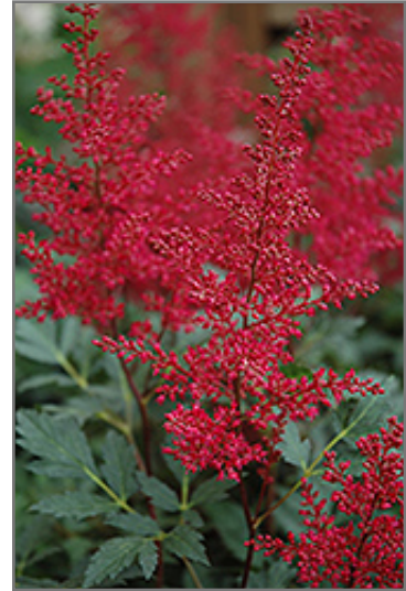
Red Sentinel Astilbe flowers