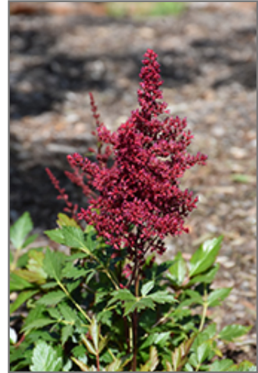
Red Sentinel Astilbe flowers

Red Sentinel Astilbe is a fine choice for the garden, but it is also a good selection for planting in outdoor pots and containers. With its upright habit of growth, it is best suited for use as a 'thriller' in the 'spiller-thriller-filler' container combination; plant it near the center of the pot, surrounded by smaller plants and those that spill over the edges. Note that when growing plants in outdoor containers and baskets, they may require more frequent waterings than they would in the yard or garden.