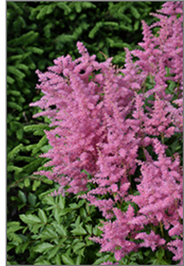
Visions in Pink Chinese Astilbe flowers