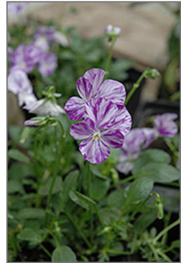
Rebecca Pansy flowers