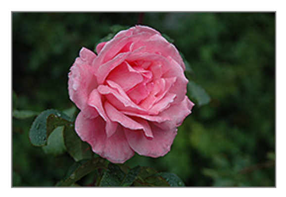
Queen Elizabeth Rose flowers