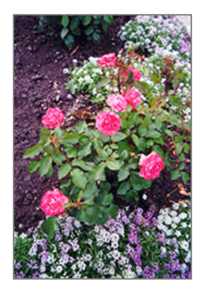
Queen Elizabeth Rose in bloom