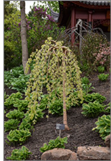
Chaparral Weeping Mulberry in bloom

This shrub performs well in both full sun and full shade. It is very adaptable to both dry and moist locations, and should do just fine under average home landscape conditions. It is considered to be drought-tolerant, and thus makes an ideal choice for xeriscaping or the moisture-conserving landscape. It is not particular as to soil type or pH, and is able to handle environmental salt. It is highly tolerant of urban pollution and will even thrive in inner city environments. This is a selected variety of a species not originally from North America.