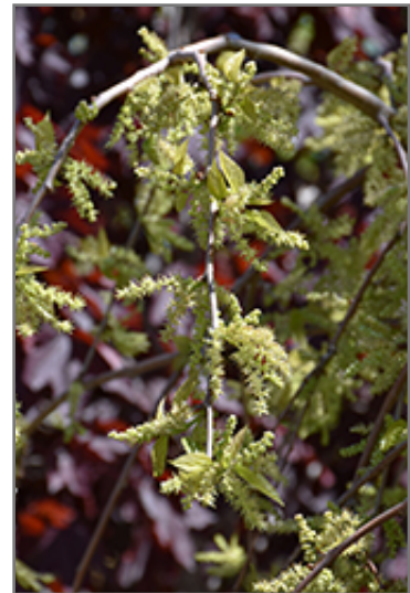
Chaparral Weeping Mulberry flowers