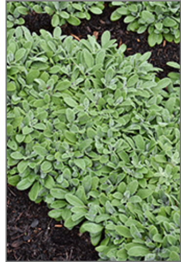
Little Lamb Lamb's Ears

Little Lamb Lamb's Ears is a fine choice for the garden, but it is also a good selection for planting in outdoor pots and containers. It is often used as a 'filler' in the 'spiller-thriller-filler' container combination, providing a mass of flowers and foliage against which the thriller plants stand out. Note that when growing plants in outdoor containers and baskets, they may require more frequent waterings than they would in the yard or garden.