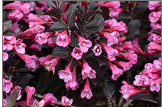
Coco Chill Weigela flowers

Coco Chill Weigela is recommended for the following landscape applications;