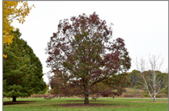
White Oak in fall

This tree should only be grown in full sunlight. It prefers to grow in average to moist conditions, and shouldn't be allowed to dry out. It is not particular as to soil type, but has a definite preference for acidic soils. It is highly tolerant of urban pollution and will even thrive in inner city environments. This species is native to parts of North America.