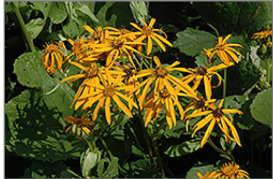
Othello Rayflower flowers

Othello Rayflower will grow to be about 30 inches tall at maturity extending to 4 feet tall with the flowers, with a spread of 30 inches. It grows at a medium rate, and under ideal conditions can be expected to live for approximately 20 years. As an herbaceous perennial, this plant will usually die back to the crown each winter, and will regrow from the base each spring. Be careful not to disturb the crown in late winter when it may not be readily seen!