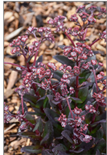
Conga Line Stonecrop flowers