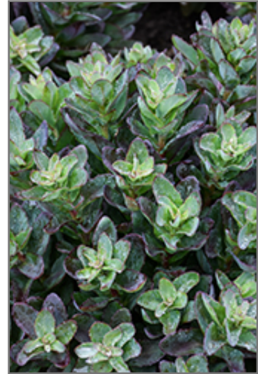
Conga Line Stonecrop foliage

Conga Line Stonecrop is recommended for the following landscape applications;