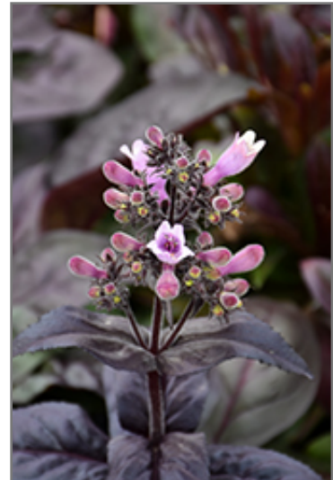
Dakota Burgundy Beard Tongue flowers

This is a relatively low maintenance plant, and is best cleaned up in early spring before it resumes active growth for the season. It is a good choice for attracting butterflies to your yard. It has no significant negative characteristics.