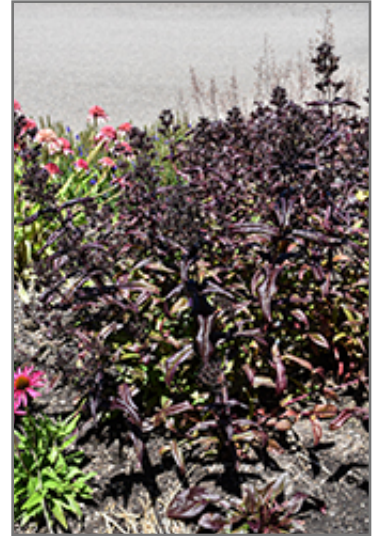
Dakota Burgundy Beard Tongue

Dakota Burgundy Beard Tongue will grow to be about 12 inches tall at maturity extending to 24 inches tall with the flowers, with a spread of 18 inches. When grown in masses or used as a bedding plant, individual plants should be spaced approximately 14 inches apart. It grows at a fast rate, and under ideal conditions can be expected to live for approximately 10 years. As an herbaceous perennial, this plant will usually die back to the crown each winter, and will regrow from the base each spring. Be careful not to disturb the crown in late winter when it may not be readily seen!