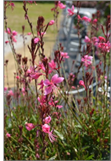
Steffi Dark Rose Gaura flowers