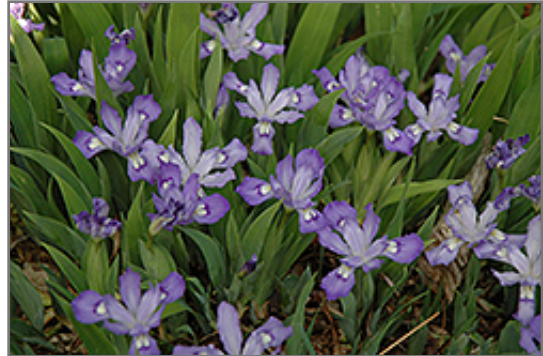
Dwarf Crested Iris flowers