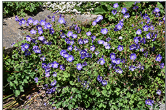
Brookside Cranesbill in bloom