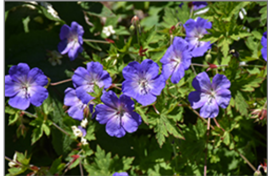
Brookside Cranesbill flowers

Brookside Cranesbill is recommended for the following landscape applications;