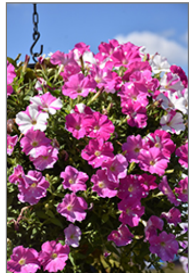
Headliner Light Pink Sky Petunia flowers