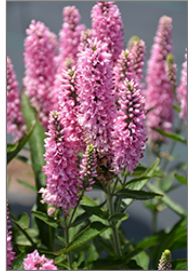
Skyward Pink Long-leaf Speedwell flowers

Skyward Pink Long-leaf Speedwell is a fine choice for the garden, but it is also a good selection for planting in outdoor pots and containers. It is often used as a 'filler' in the 'spiller-thriller-filler' container combination, providing a mass of flowers against which the larger thriller plants stand out. Note that when growing plants in outdoor containers and baskets, they may require more frequent waterings than they would in the yard or garden.