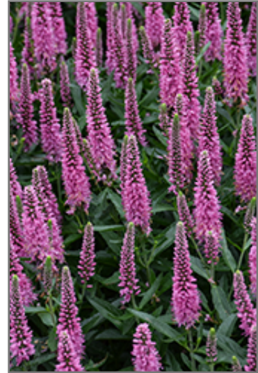
Skyward Pink Long-leaf Speedwell flowers