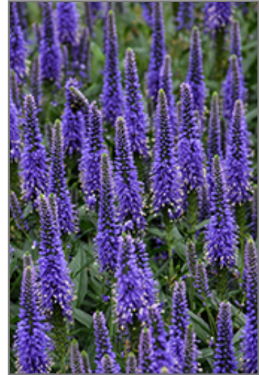
Skyward Blue Long-leaf Speedwell flowers