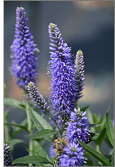
Skyward Blue Long-leaf Speedwell flowers

Skyward Blue Long-leaf Speedwell is a fine choice for the garden, but it is also a good selection for planting in outdoor pots and containers. It is often used as a 'filler' in the 'spiller-thriller-filler' container combination, providing a mass of flowers against which the larger thriller plants stand out. Note that when growing plants in outdoor containers and baskets, they may require more frequent waterings than they would in the yard or garden.