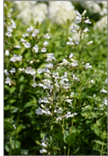
Foxglove Beardtongue flowers