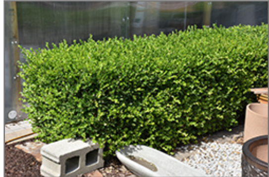
NewGen Independence Boxwood