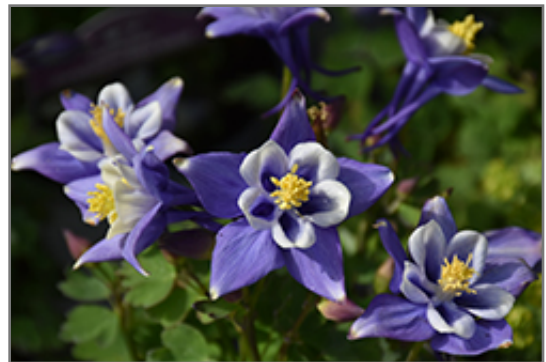
Earlybird Blue and White Columbine flowers